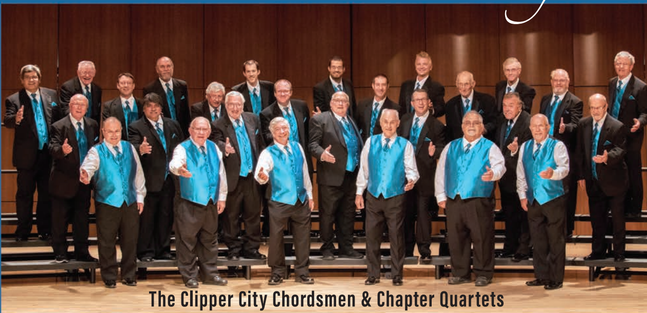
The Clipper City Chordsmen & Chapter Quartets